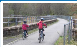
Childrens bikes 20% off!

Hire price includes: Helmet, Map, Lock, Repair kit, Pump, and a Rucksack.